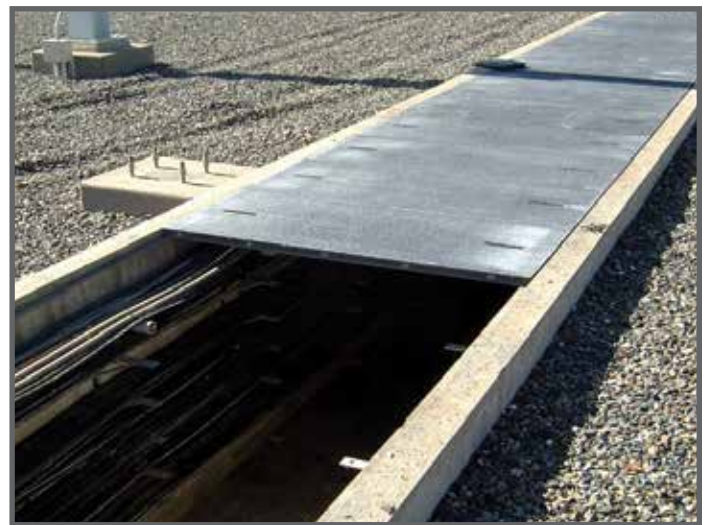
Solid FRP Trench Covers