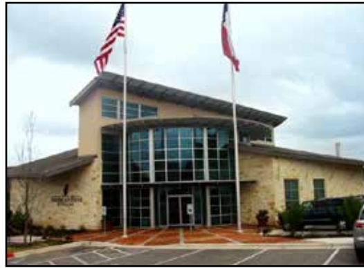
Application: Sunscreens Product: Fibergrate® Molded Grating