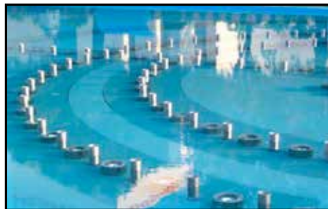
Application: Fair Park Fountain Product: Fibergrate Molded Grating