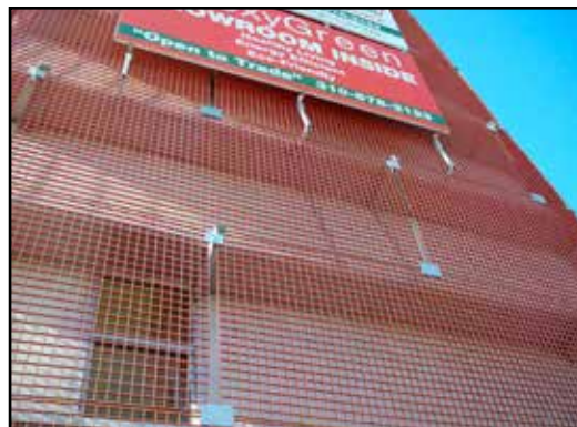
Application: Screening/Sunscreens Product: Fibergrate Molded Grating