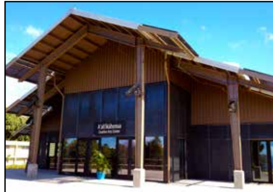
Application: Screening/Sunscreens Product: Safe-T-Span® Pultruded Grating